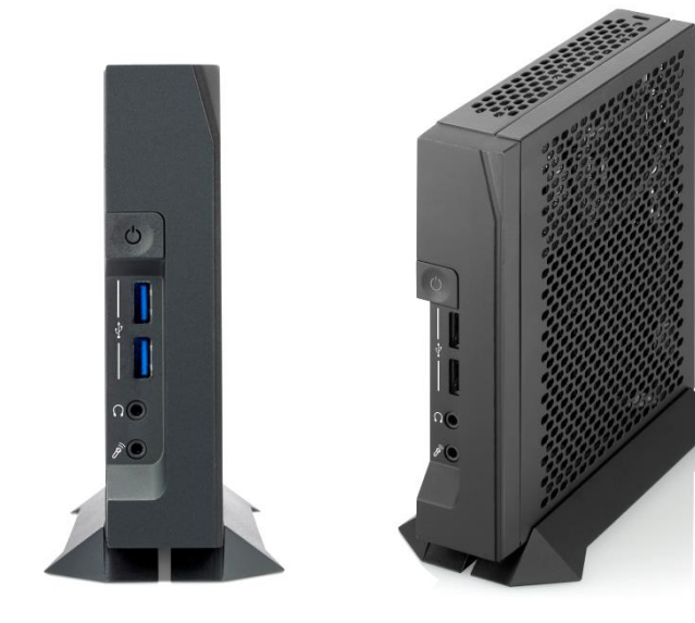
(Chassis with desk stand installed, vertical operating mode)